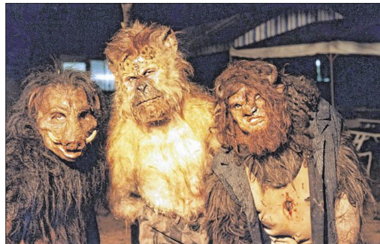
“Lost Soul: The Doomed Journey of Richard Stanley’s Island of Dr. Moreau” is a look at the famously disastrous adaptation of H.G. Wells classic.